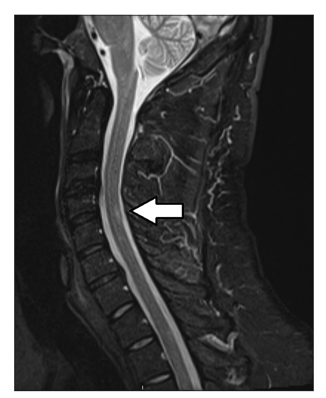
Fig. 3. Cervical MRI on August 31, 2021 (T2)

and there was also a decrease in leg spasticity. However, sensitivity derangement remained, but lower in dynamics. Unfortunately, impairment of pelvic organs persisted. On September 9, the patient was discharged for ambulatory rehabilitation after increasing the ambulatory dose of azathioprine to 100 mg per day.