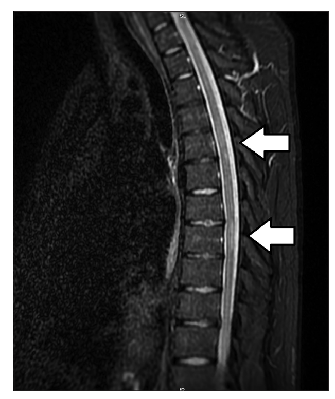
Fig. 5. Thoracal MRI on March 17, 2022 (T2)

and there was also a decrease in leg spasticity. However, sensitivity derangement remained, but lower in dynamics. Unfortunately, impairment of pelvic organs persisted. On September 9, the patient was discharged for ambulatory rehabilitation after increasing the ambulatory dose of azathioprine to 100 mg per day.