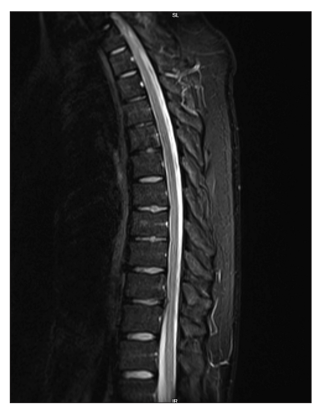
Fig. 1. Thoracal MRI on April 8, 2021 (T2)

to the feet, and two days later the patient was admitted to the ER as described above.